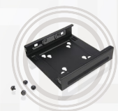
ThinkCentre Tiny VESA Mount II