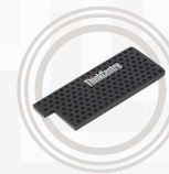
ThinkCentre Tiny IV 1L Dust Shield